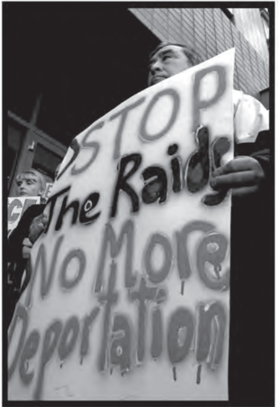
Oakland, California -- Protesting raids at a local hotel.