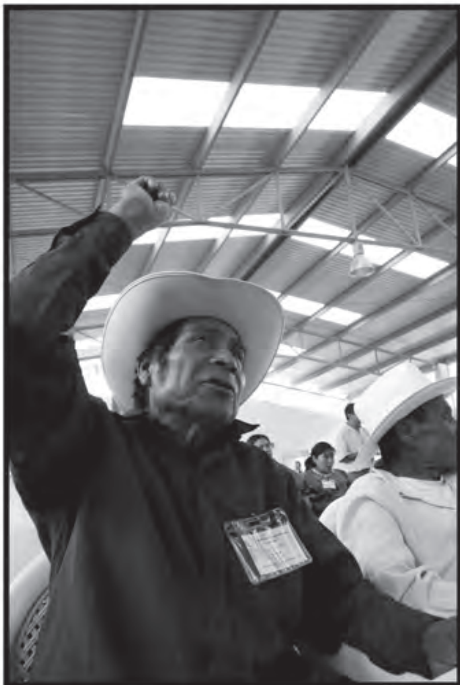
Santiago Juxtlahuaca, Oaxaca, Mexico -- Indigenous farmers protest the impact of NAFTA.

The Frente Indigena de Organizaciones Binacionales (Binational Front of Indigenous Organizations – FIOB) conducted a series of organized discussions among its California chapters to formulate a very progressive position on immigration reform, with the unique perspective of an organization of migrants and migrant-sending communities. Because of its indigenous membership, FIOB campaigns for the rights of migrants in the U.S. -- for immigration amnesty and legalization for undocumented