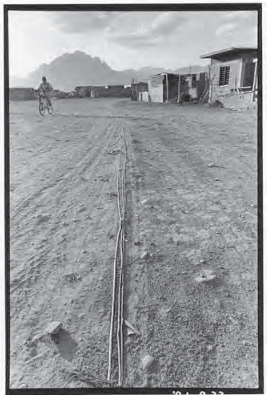
Monterrey, Mexico -- La Alianza barrio, a community of displaced people, who work in maquiladoras.

As the Mexican economy, especially the border maquiladora industry, became increasingly tied to the U.S. market, Mexican workers lost jobs when the market for what those factories produced shrank during U.S. recessions. In 2000-2001 400,000 jobs were lost on the U.S./Mexico border, and in the current recession, thousands more have been eliminated.