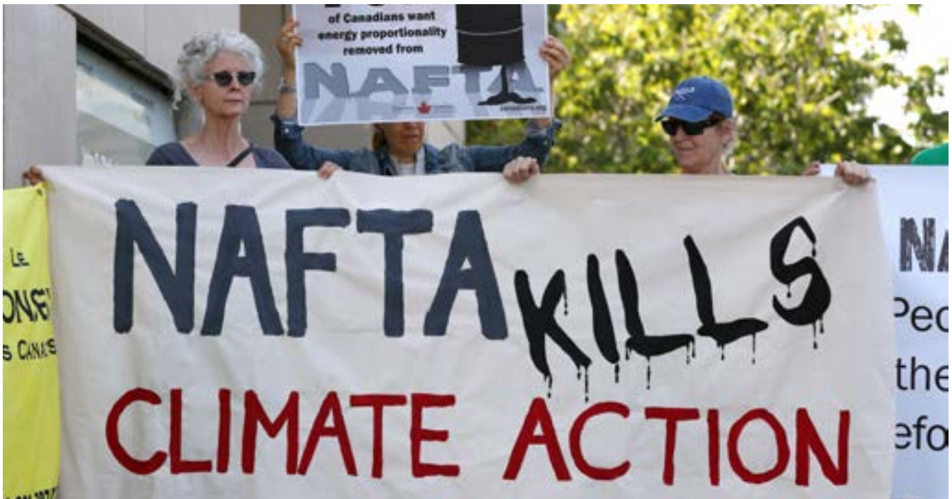
Anti-NAFTA demonstrators stand outside the building where the NAFTA renegotiations are being held in Ottawa, Ontario, September 26, 2017.