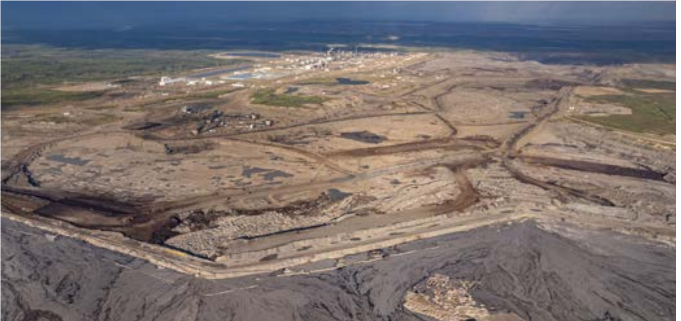
A general view shows an oil sands mining operation and facility near Fort McKay, Alberta, on September 7, 2022.

treatment and most-favored nation treatment, since other similar US-based pipelines continue to operate, and Article 1110 on expropriations because of the effect on future lost earnings. TC Energy's ISDS case focuses on the claim that its investments were not given fair and equitable treatment (FET) per NAFTA Article 1105 on the minimum standard of treatment that states must provide to foreign investors.