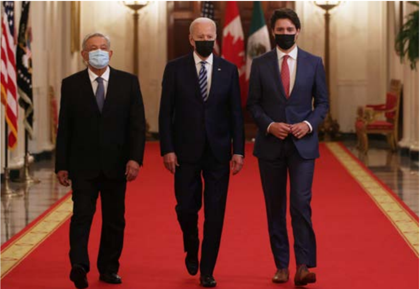
U.S. President Joe Biden (C), Canadian Prime Minister Justin Trudeau (R) and Mexican President Andres Manuel Lopez Obrador (L) walk in the Cross Hall prior to a North American Leaders' Summit (NALS) at the White House November 18, 2021 in Washington, DC.

Finley Resources lawyer said that "Mexico promised that Finley's investments would be protected," and that instead, the country's courts provided "little to no movement" on the dispute while Mexican oil service companies that made similar claims received more favorable treatment. To Finley, Pemex failed to pay for services provided by the companies, while other contracts were not honored by Mexico. 35